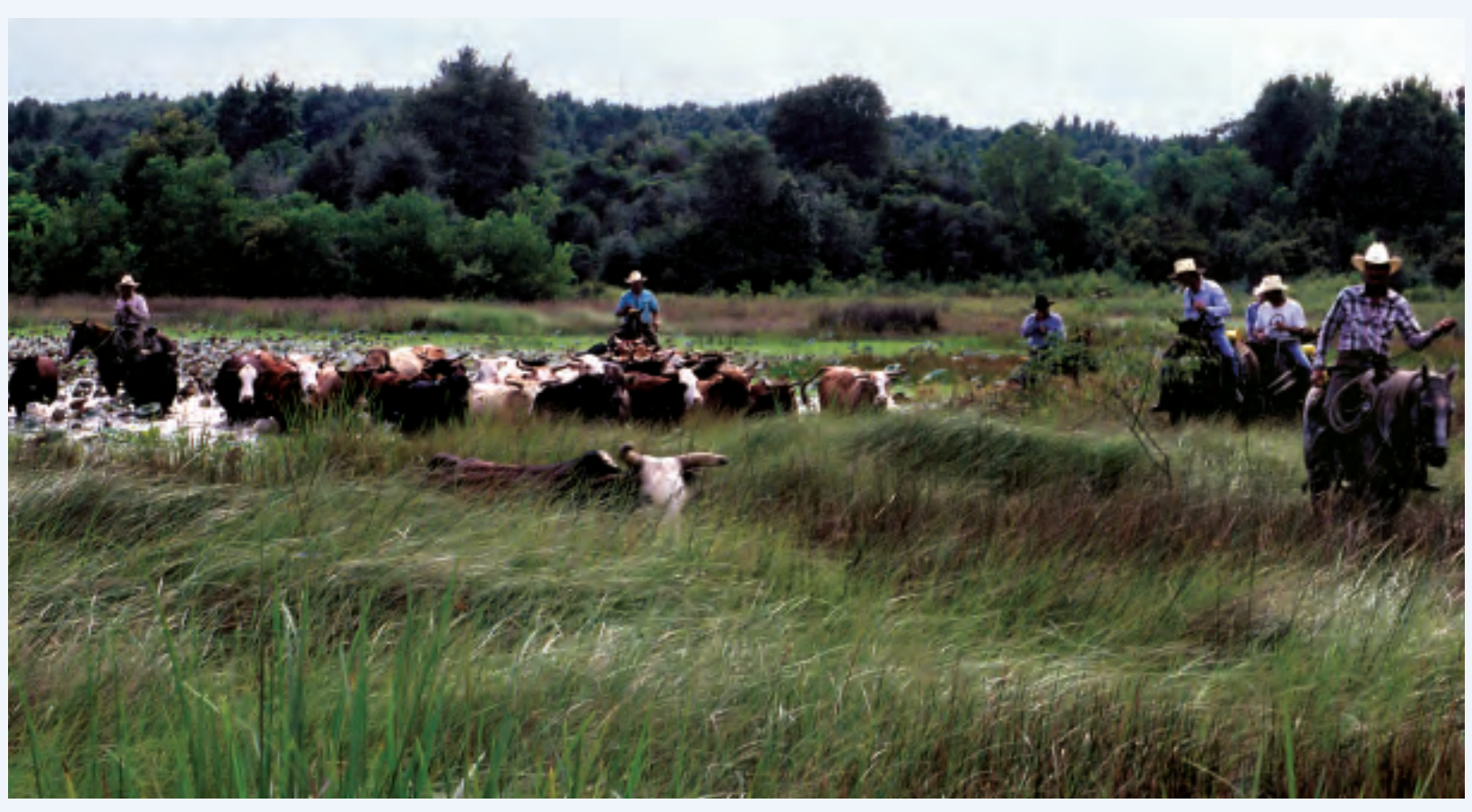
Perry Ridge, 1993. A small bunch is trailed to the pens. Though prickly pear grows on the coastal dunes, lily pads are more common than cactus in Louisiana's sea of grass.

To look hard at this place uncovers a lot of Louisiana's early history, a history that has been little known and largely forgotten. That history concerns cattle, horses, and the open range. Raising cattle was the dominant economic pursuit in southwest Louisiana for the first 125 years of its settlement history. The