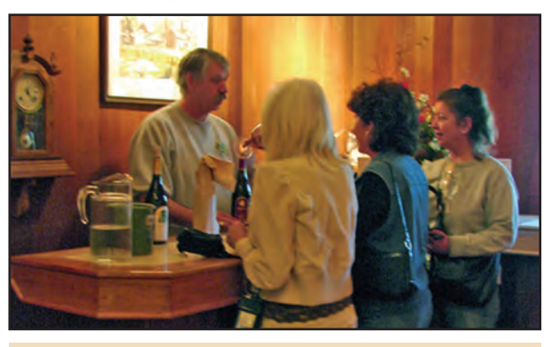
Associated Events Russian River Wine Road Alexander Valley Winegrowers

There are two club programs, offering quarterly or biannual shipments.